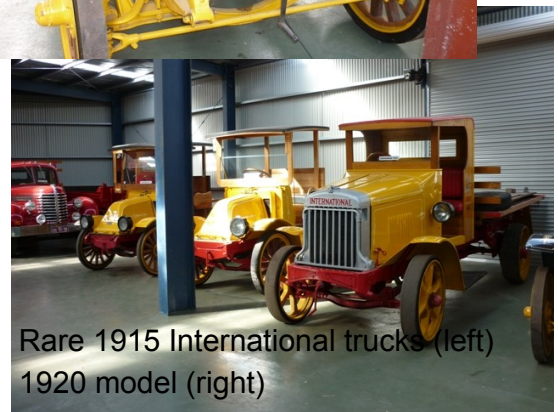
Rare 1915 International trucks (left) 1920 model (right)

Fast forward to 2012, at the age of 77 his collection has grown to 37 fully restored vintage trucks including rare International models. His range includes a long list of British and American trucks manufactured in the early 1900's: AEC, Albion, Bean, Bedford, Brockway, Diamond T, Federal, Indiana, International, Leyland, Mapleleaf, Morris Commercial, Republic and Thornycroft.